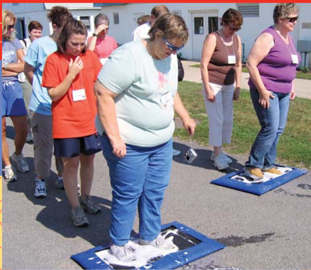
Teachers received a tour of a real dairy farm at County and learn about controlling contamination on the farm.